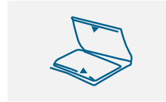
Fold product in half