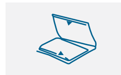
Fold product in half